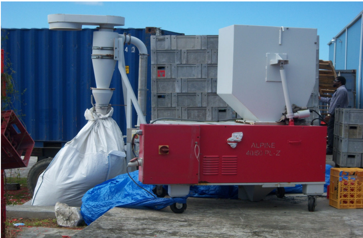
Granulator used to grind old crates