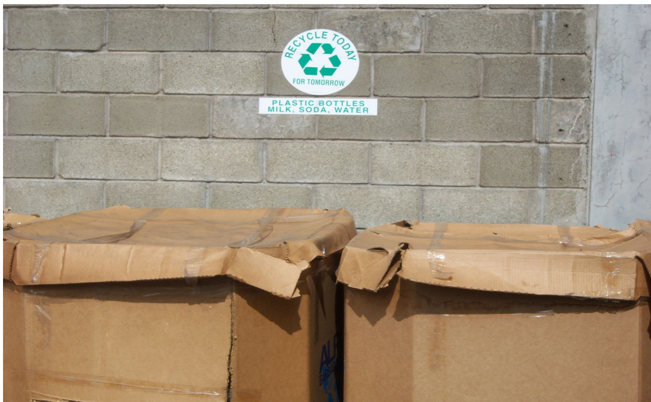
Recycling and storage area at the Antigua Brewery

These rejected preforms and overblown or defective bottles are donated to ABWREC for recycling and exportation off the island to other manufacturing countries such as China.