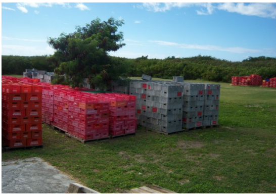
Red and grey crates