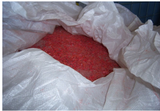
Grinded red crates